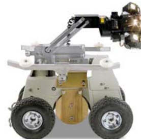
IBAK ARGUS with camera tractor extension and ancillary light