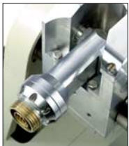
IBAK ARGUS folding connector