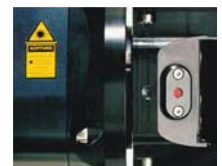
IBAK ARGUS laser measurement