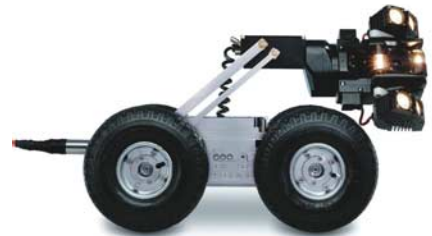
IBAK ARGUS with pneumatic tyres