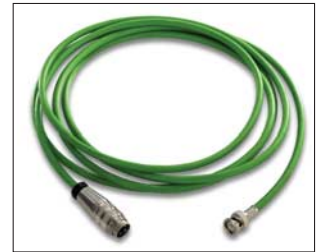
Video connection cable