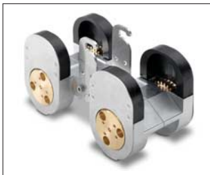
Camera tractor extension for KRA65 for the inspection of 300 mm (12 in.) pipes upwards