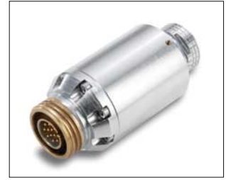
Adapter plug for direct connection of the camera and the camera cable