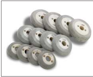
Granulated rubber wheel sets for maximum thrust