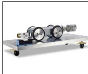
An inclinometer system with calibrating device is available for all camera tractors