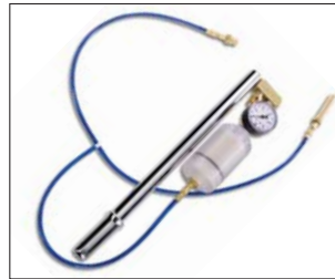
Pressure test set with pressure gauge and air dehumidifier