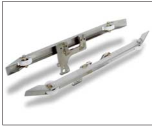
Ovoid pipe attachment for the inspection of ovoid pipes