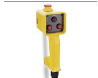
Remote control for cable reel and winch