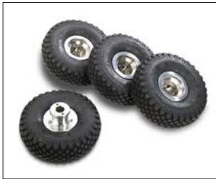
Pneumatic tyres for the inspection of 300 mm (12 in.) pipes upwards