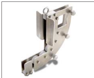
Cable deflection unit to guide the camera cable at the transition from the manhole to the mainline sewer