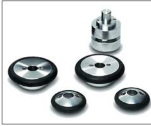
Various wheel sets for the inspection of 100 mm (4 in.) pipes upwards