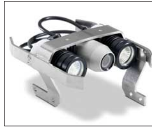
Ancillary lights and control camera for the LISY System