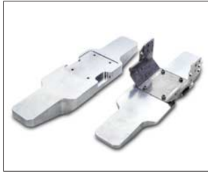
Additional weight to increase the weight of the camera tractor