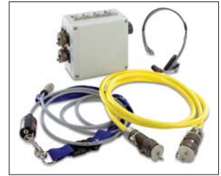
Extension Kit for connection of a coiler to a control box using the camera cable of the cable reel