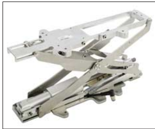
Electric height adjusting unit to position the camera