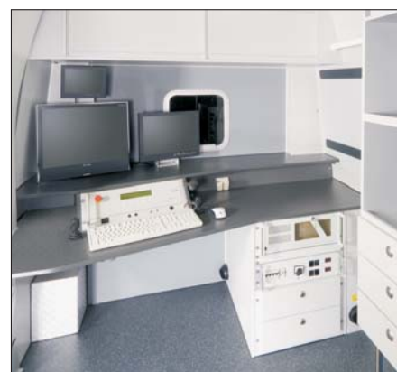
CLASSIC LINE interior outfitting