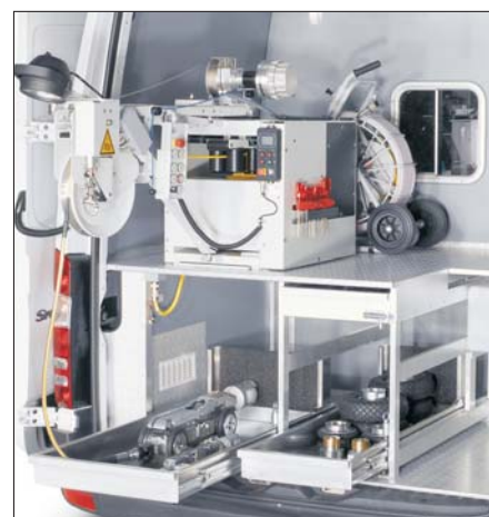
Rear vehicle section with ample space for customer-specific outfitting wishes