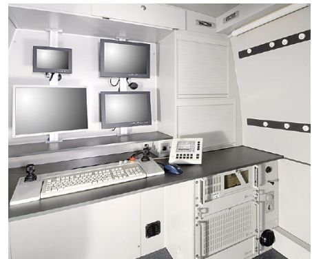
TOP LINE operator's section with high quality outfitting components and well-arranged workplace