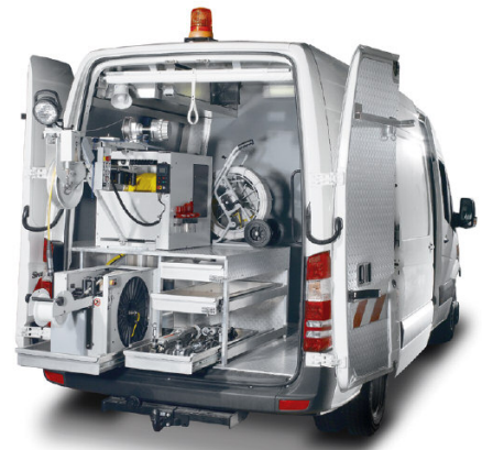
Rear vehicle section with ample space for customer-specific outfitting wishes