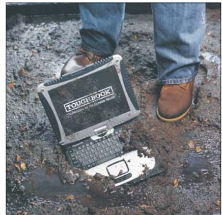
Ideal for operation in rough conditions