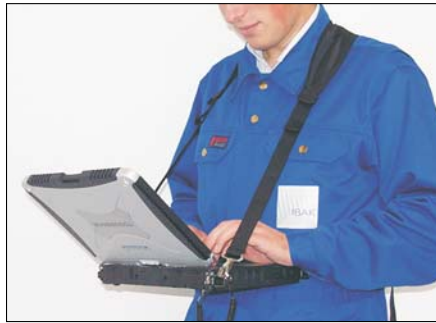
IBAK IKAS 32 MOBIL Keyboard mode