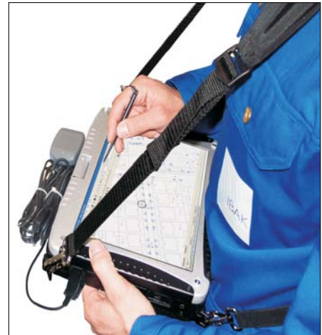
IBAK IKAS 32 MOBIL Touchscreen mode

IBAK IKAS 32 MOBIL is a perfect supplement to sewer TV inspection with IKAS 32. Digital manhole inspections can be performed directly on site for each desired database interface to complete the sewer inspection or as a separate loaded project. IBAK IKAS 32 MOBIL has been extended with many useful features to facilitate comfortable, mobile inspection (see features). GPS mode supports localisation of inspection objects and even guides the operator over the CAD map in Moving Map Mode like a navigation system. We recommend using a Panasonic Toughbook as a reliable partner in this rough environment. Extreme ambient conditions such as rain, dust, frost or vibrations are no problem for the CF-18 Toughbook.