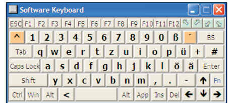
IBAK IKAS 32 MOBIL Keyboard strip