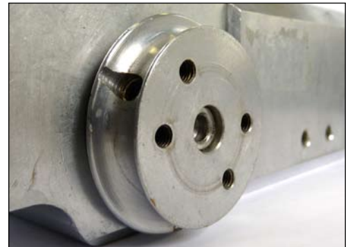
Once you have removed the size 52 rims from the KRA 65...