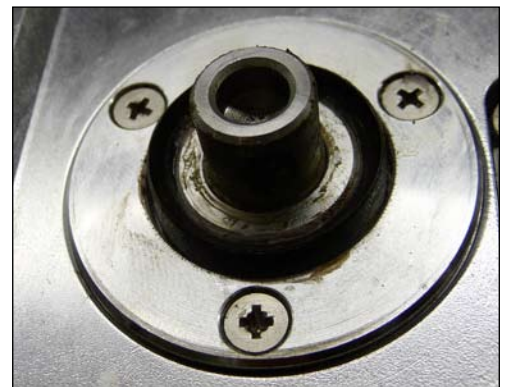
... the wheel shaft is thoroughly cleaned. The shaft sealing ring must be replaced.